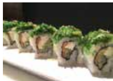
South Park Roll (8pcs) In: Inari, Tofu, Cucumber Top: Green Seaweed, Sesame