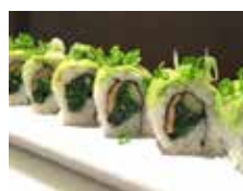
Greenscape Roll (8pcs) In: Inari, Green Seaweed Cucumber Top: Avocado, Green Onion Sesame