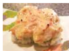
Baked Salmon Roll In: Krab, Avocado Top: Salmon, Masago w/ Creamy Sauce