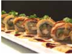
Golden Munch Roll (8pcs) 🌶️ In: Sweet Potato Tempura, Zucchini Tempura, Cream Cheese w/ Spicy Mayo, Teriyaki Sauce, Green Onion, Sesame (Lightly Fried Tempura Style)