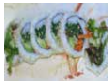
Veggie Roll (6pcs) In: Green Seaweed, Avocado, Cucumber, Baby Radish, Burdock, Sesame