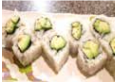
Avocado Roll (8pcs) In: Avocado w/ Sesame