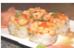
Baked Scallop Roll In: Krab, Avocado Top: Scallop, Masago w/ Creamy Sauce