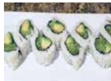
Avocado & Cucumber Roll (8pcs) In: Avocado, Cucumber w/Sesame