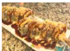
Chula Vista Roll 🌶️ In: Krab, Shrimp Tempura, Cream Cheese, Avocado w/ Eel Sauce, Crunchy on top, Sesame, Spicy Mayo