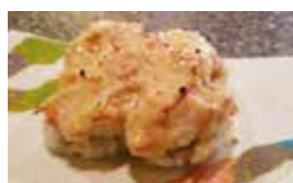
Baked Krab Roll In: Krab, Avocado Top: Krab w/ Creamy Sauce