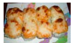
Pizza Roll 🌶️ In: Krab, Avocado Top: Spicy Mayo, Mozzarella Cheese

Krab = Imitation Crab All orders are final and non-refundable.