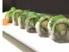
Bonsai Roll (8pcs) In: Avocado, Cucumber, Tofu Top: Shiso (Japanese Basil) w/Sesame Sauce