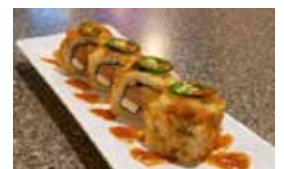
National City Roll 🌶️ In: Salmon, Cream Cheese, Avocado w/ Chili Sauce, Jalapeño, Sesame