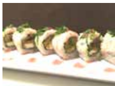
Pink Garden Roll (8pcs) In: Avocado Tempura, Tofu Tempura w/ Japanese Basil (Shiso) Plum Coconut Sauce