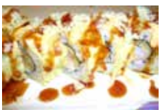
San Ysidro Roll 🌶️ In: Smoked Salmon, Cream Cheese, Avocado w/ Eel Sauce, Crunchy on top, Sesame, Spicy Mayo