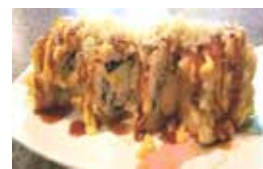
Bonita Roll 🌶️ In: Krab, Avocado w/ Spicy Mayo, Eel Sauce, Crunchy on top, Sesame