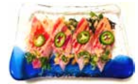
Spicy Seared Ahi