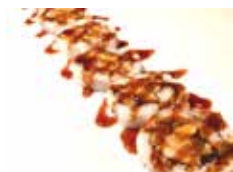
Vegetable Tempura Roll (6pcs) In: Vegetable Tempura (Zucchini, Sweet Potato, Pumpkin) w/ Teriyaki Sauce, Sesame

We strongly advise that you check all the ingredients in the roll prior to ordering. Food may take longer to prepare during busy times.