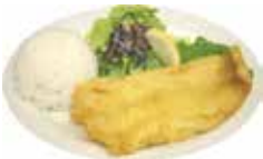
Crispy Fried Tilapia