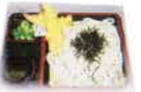
Ten Zaru Udon