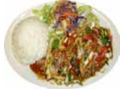
Chicken & Vegetables Stir Fry

Served with Miso Soup, Rice, and Salad Miso soup not available with To Go orders before 4 p.m.