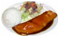
Grilled Salmon Teriyaki