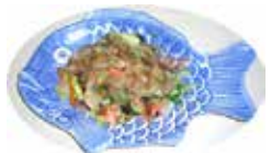
Salmon Skin Salad