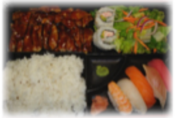
Chicken Teriyaki and Sushi