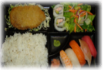
Tonkatsu and Sushi