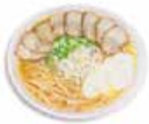
Chashu Miso Ramen