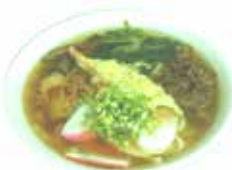
Hanaoka Special Udon

Egg 1.50 Kimuchi 2.00 Dried Seaweed 1.00 Crunchy (Tempura flake) 1.00