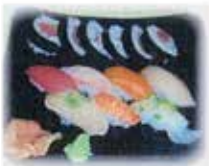
Sushi Dinner (A)