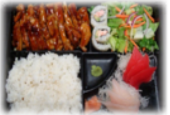
Sashimi and Chicken Teriyaki