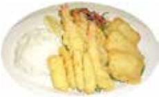
Fried Seafood Combo

Dine-in Only. 12 years old and under. Served with Fried Potato, Rice, Salad and Ice Cream.