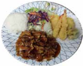
Chicken Teriyaki and Tempura