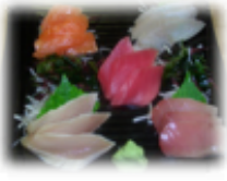
Sashimi Dinner (B)