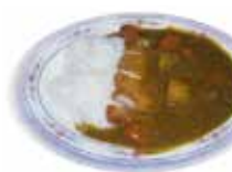
Katsu Curry Rice