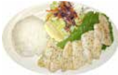
Grilled Orange Raughy